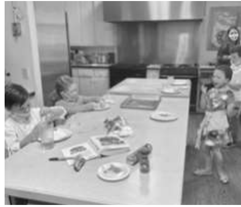
Making resurrection rolls